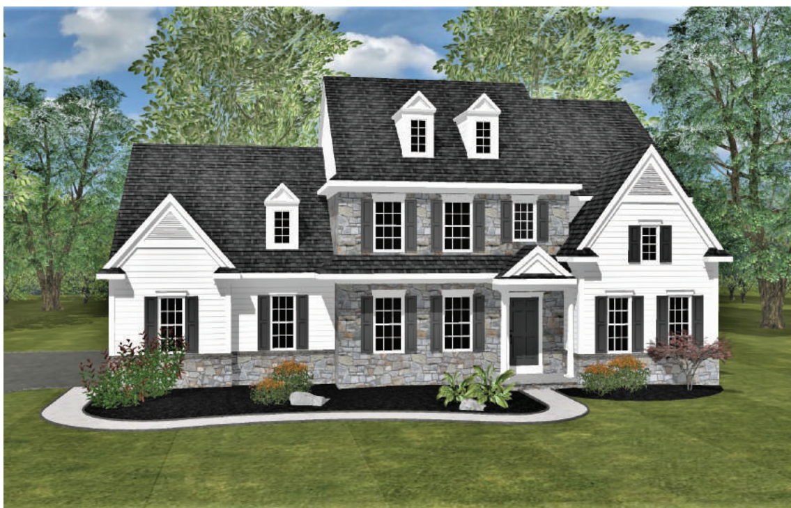
ELEVATION D (ADDS 11 SQ. FT. TO GARAGE)